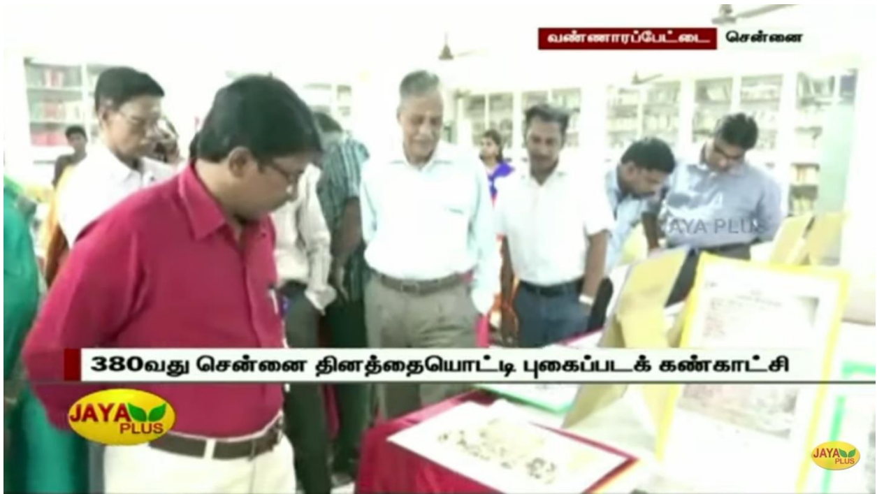
JAYA PLUS TV, 20.09.2019: Madras Week Celebration- Two Days Photo Exhibition, on “History of Madras, 20 th & 21 st August 2019.