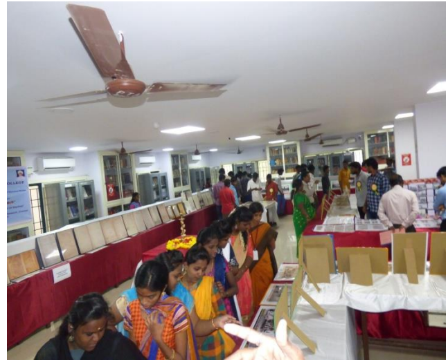
Professors and Students Visiting, Madras Week-Photo Exhibition on “History of Madras, 20 th & 21 st August 2019.