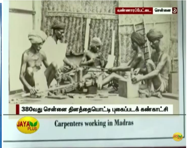
JAYA PLUS TV, 20.09.2019: Madras Week Celebration- Two Days Photo Exhibition, on “History of Madras, 20 th & 21 st August 2019.