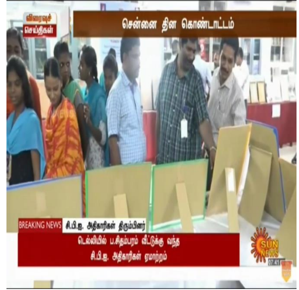
SUN NEWS, 20.09.2019: Madras Week Celebration- Two Days Photo Exhibition, on “History of Madras, 20 th & 21 st August 2019.