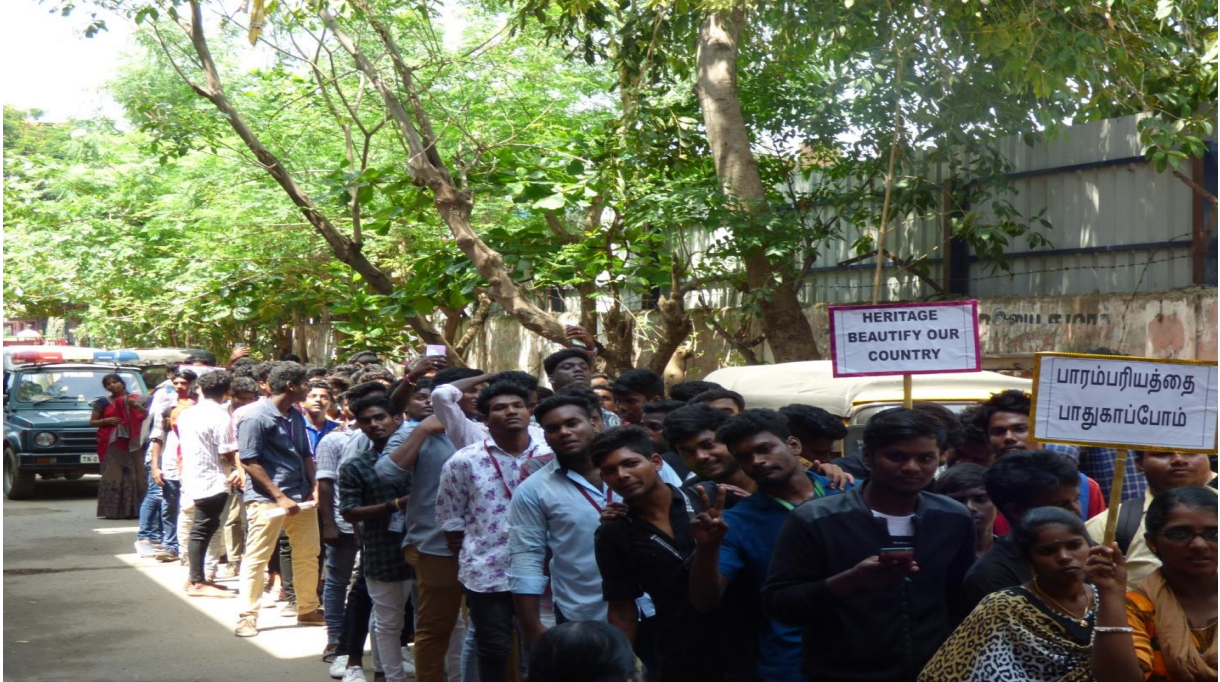
HERITAGE WALK: Madras Week Celebration, 19.09.2019.