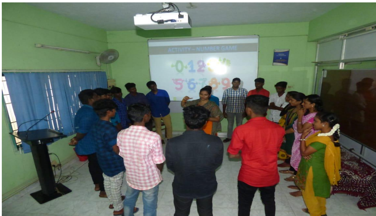
Group Activities: Three weeks (from 17-07-2019 to 31-07-2019) certificate course on “Good Governance and Effective Participation”