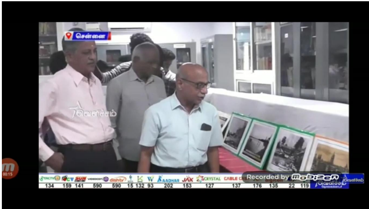
VELICHAM TV, 20.09.2019: Madras Week Celebration- Two Days Photo Exhibition, on “History of