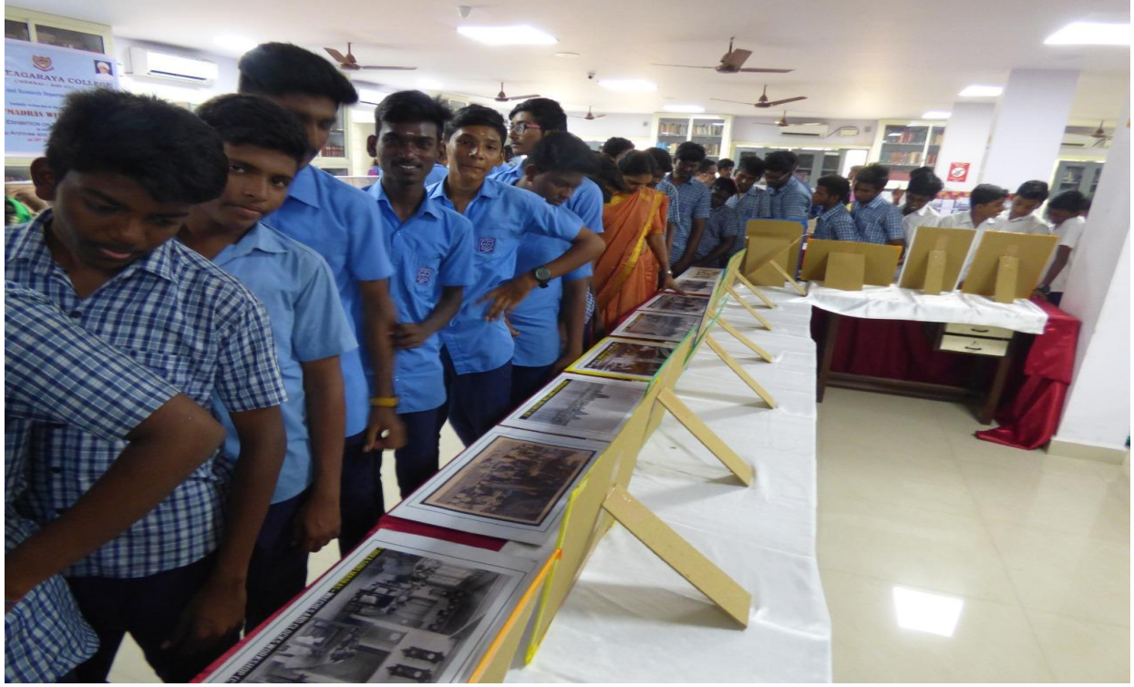
School Students Visiting, Madras Week-Photo Exhibition on “History of Madras, 20 th & 21 st August 2019.